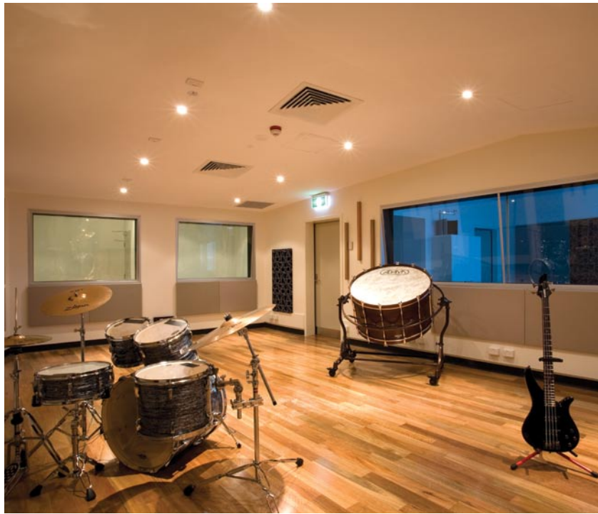
The Academy's theatre; right: one of the music studios