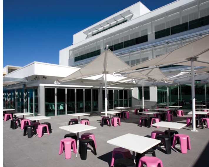
Creative spaces at QACI

intention of meeting the explicit programming needs of the staff and students, Laurence says few educational facilities are constructed with this ultimate goal as part of the overall vision.