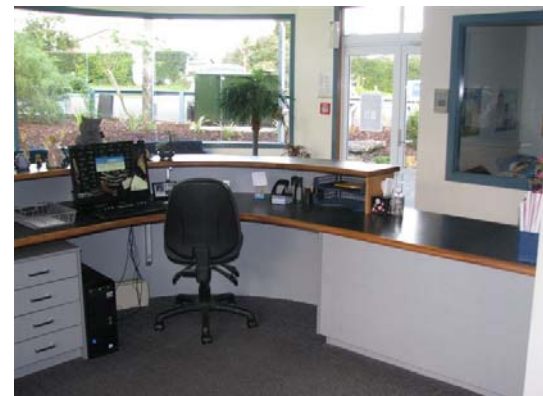
Before and after