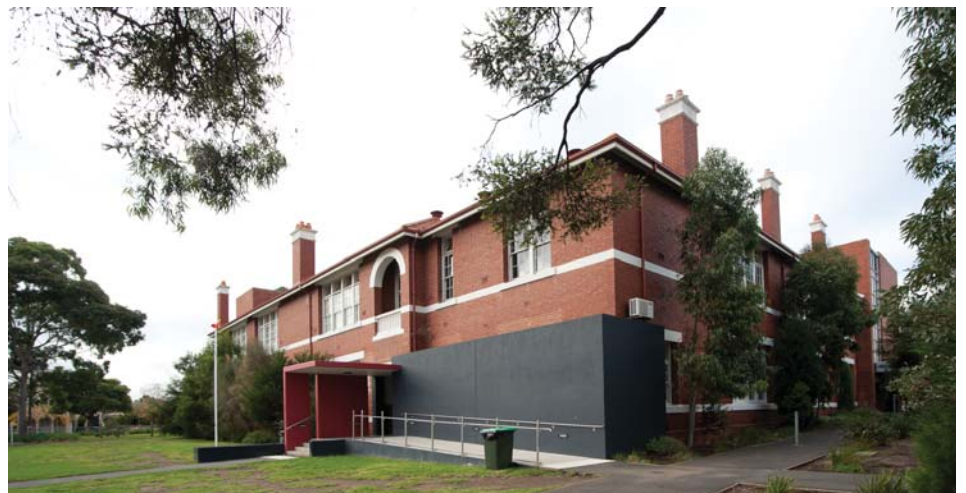
Old and new merge in the upgraded school