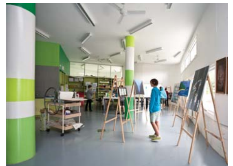
Colour is everywhere in the refurbished play areas and classrooms

Architects described the final concept as “a three level building with a undulating perimeter constructed from double brick with a deep cavity, allowing the building to perform structurally. The exposure of the inner skin of brickwork, and the underside of the slabs, maximises the building’s latent thermal stability, considerably reducing the need for additional climate control. The four metre floor-to-floor height required to meet the existing building at each level also increases the quality of daylight deep into the proposed plan.”