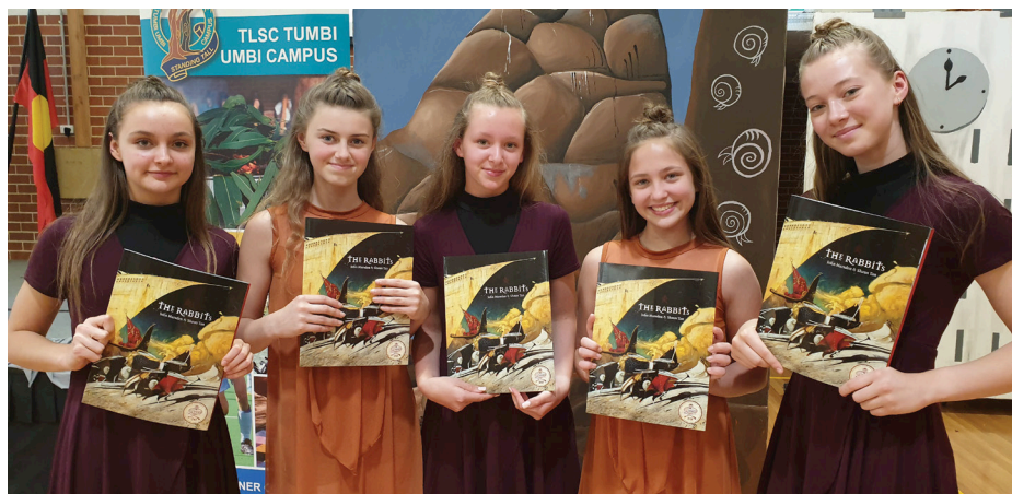
Tuggerah Lakes Secondary College Tumbi Umbi Campus won the National Reconciliation Story Award in 2018 and also took out Story of the Year for their performance based on John Marsden's novel The Rabbits

Last year, 240 schools performed; popular themes included cyber bullying, the refugee crisis, and the environmental impact of plastic bags.