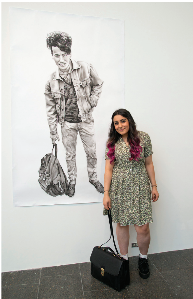
Sarah Ujmaia, A depiction of Andrea Italia , charcoal and graphite 200.0 x 120.4 cm (sheet) St Monica's College, Epping