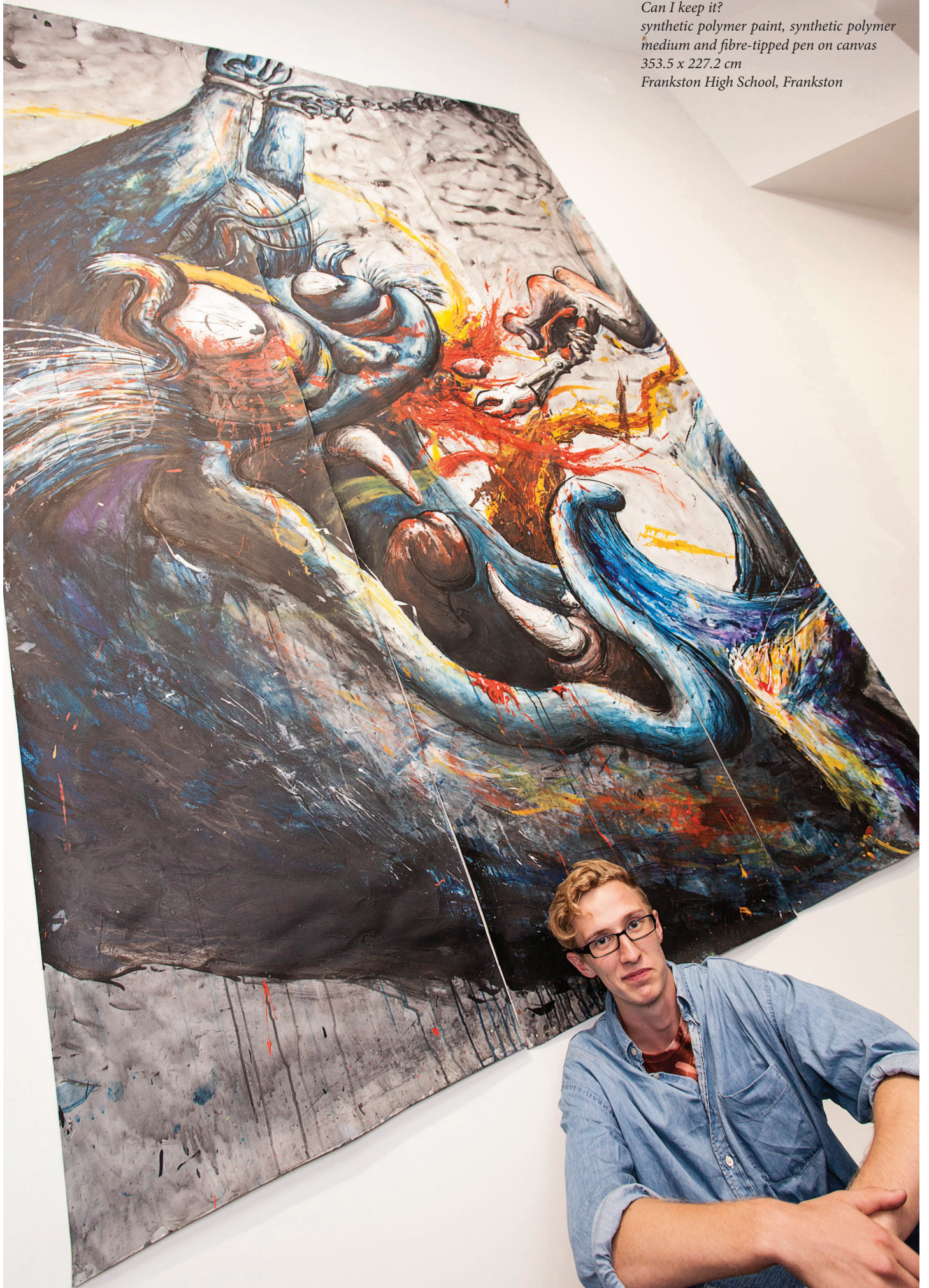
Glen Clancey Can I keep it? synthetic polymer paint, synthetic polymer medium and fibre-tipped pen on canvas 353.5 x 227.2 cm Frankston High School, Frankston