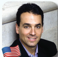
Daniel Pink Leading Thinker on Motivation, Innovation & Creativity