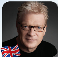
Sir Ken Robinson Internationally recognised leader in the development of Education Creativity and Innovation

EduTECH 2013 is Australia's largest education technology event and the ONLY event, anywhere in the world, where you can hear from ALL of these international education gurus: