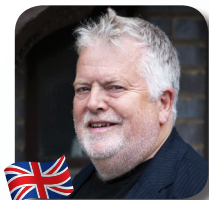
Stephen Heppell Europe's leading online education expert