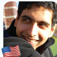
Sal Khan Founder Khan Academy