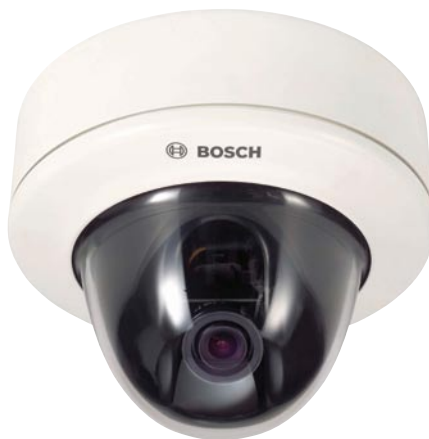
Bosch Flexidome camera for outdoor locations easily identified.

The installation of a CCTV surveillance system acts as visible deterrent to unwelcome loiterers in front of schools and the risk of their approaching children. Visible cameras on the exterior of buildings communicate the message that faces and vehicle number plates can be