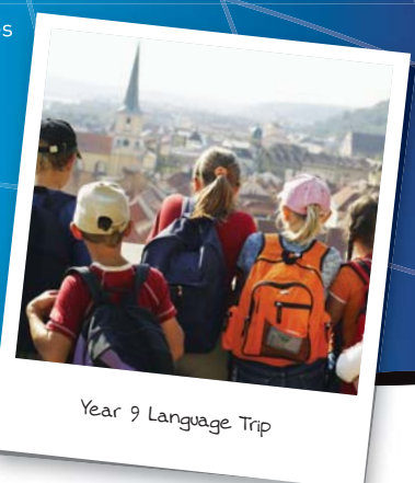
Year 9 Language Trip

Clinics Australia Wide. To make an appointment or locate your nearest clinic call 1300 658 844 or visit www.traveldoctor.com.au