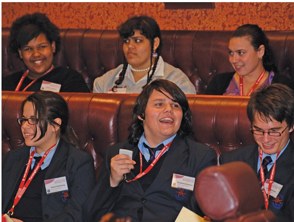
Drama in the House. TurningPoint Student Response System and Keypads were used to record audience votes